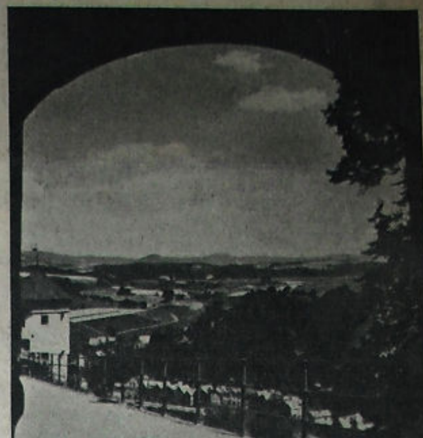
This is how the new Division Rest Center at the Oberhaus in Passau will look to the first contingent of GIs arriving on or about the Fourth (left), and this is how the world will look from the old castle drawbridge once they're in. (right)