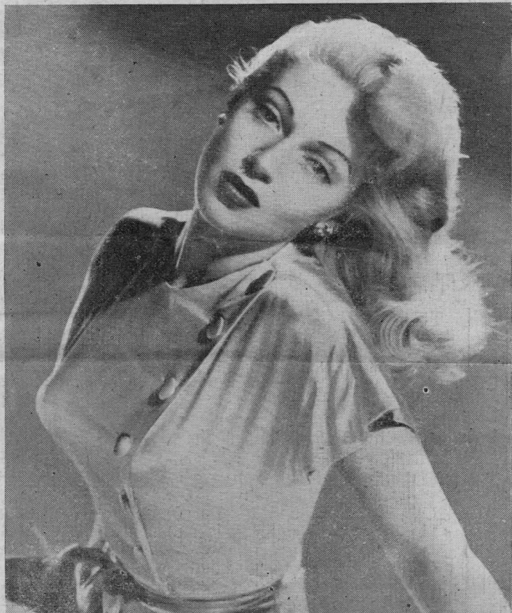
Obviously done to a turn and ready to turn over is luscious Lana Turner of cinema city fame.