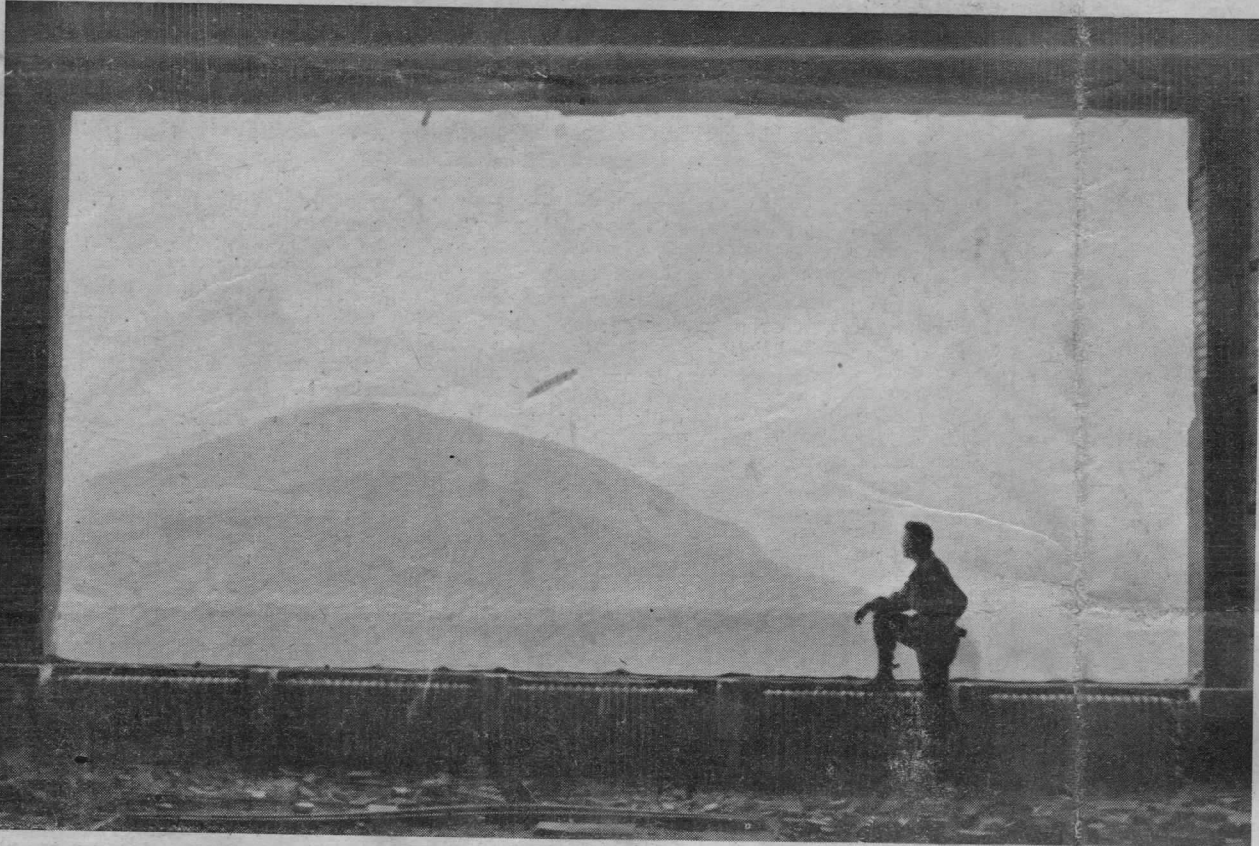
Gazing out the shattered window where once Hitler fancied his fame would last a thousand years is an 83rd Signalman, one of 40 who made the first I and E sponsored tour to Berchtesgaden.