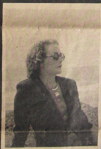
Olga From The Volga