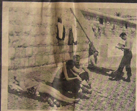
Wacs Relax, Too