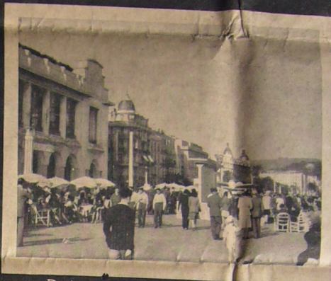
Red Cross Promenade - Nice