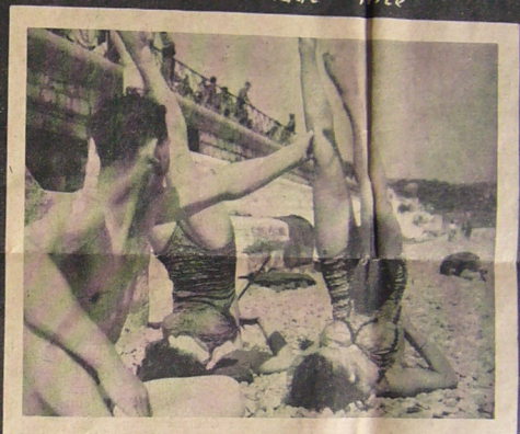
Fit For A Yank