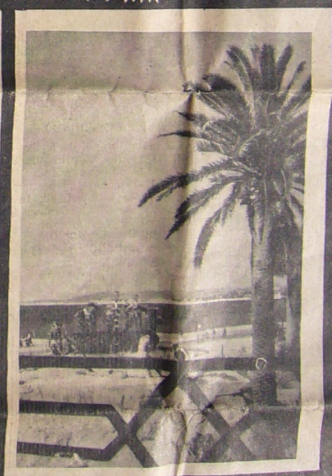
Just Like California