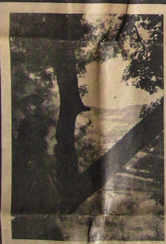
V As In Rendezvous