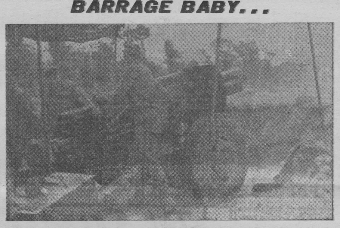
Caught by the camera at the moment of recoil, one of the big guns of the 324th FA thunders home another message to Hitler as the doughs somewhere out front close in under its protective cover. The 83rd Artillery has delivered over a quarter of a million of these messages so far, and more are on their way.

P.S.: The next day the boys collected their Paris passes from Colonel Cook.